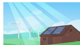
Fossil fuels and renewable energy