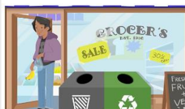
Sustainability and plastics