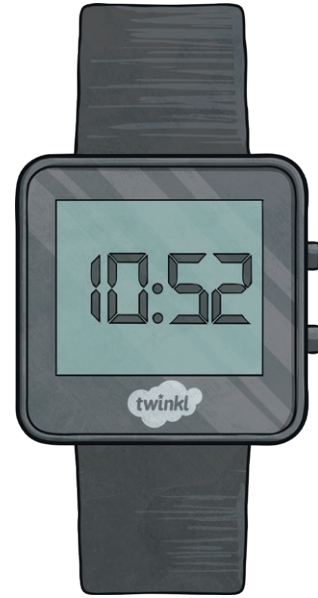
Figure out the correct time for each country.

Complete the table below. Use the clocks above to help you.